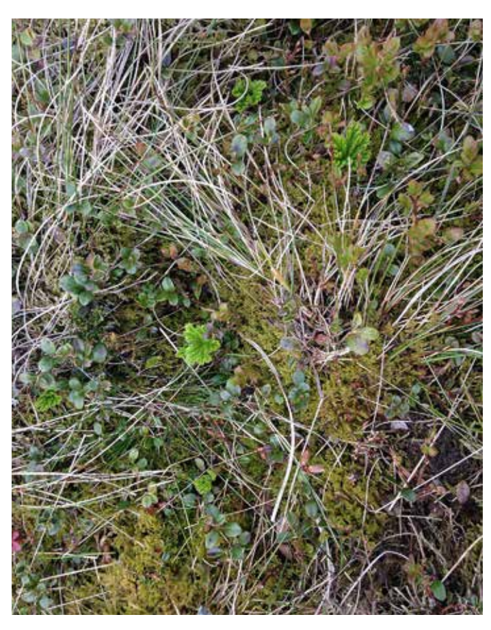
Spot the berries! Crowberry, Cloudberry, Billberry and Cowberry all growing together in SE0173 on Great Whernside

I'm looking forward to returning again this summer!