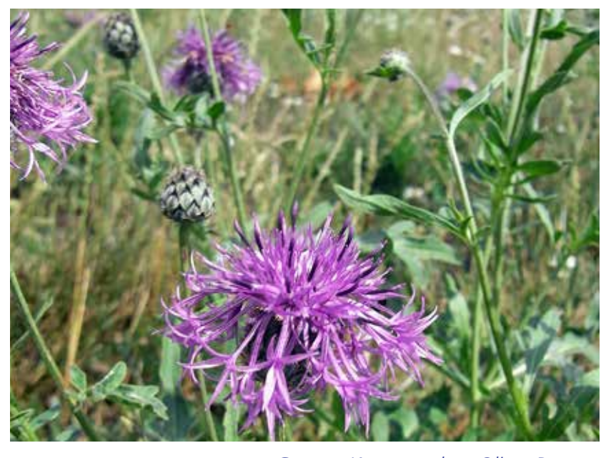
Greater Knapweed. Oliver Pescott

Follow us on Twitter @theNPMS to help spread the word