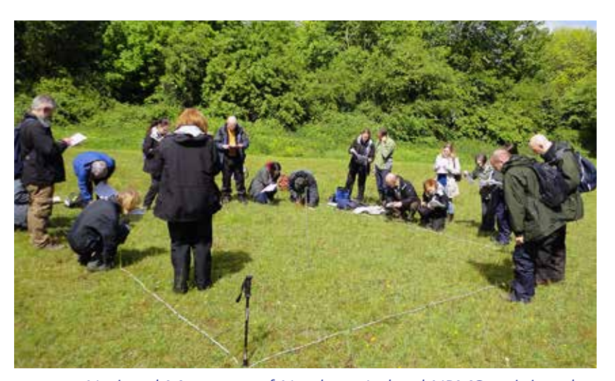
National Museums of Northern Ireland NPMS training day