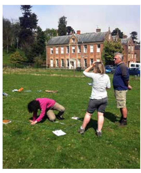
Training at FSC Nettlecombe Court

It was fantastic to visit so many places across the UK and it was wonderful to meet so many of our volunteers. As you can see from the selection of photos the weather was mostly (but not always) on our side!