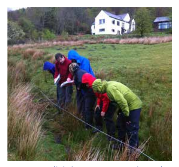
Slightly soggy at FSC Blencathra