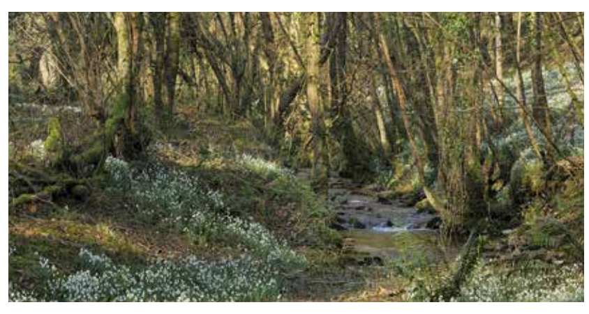
Snowdrop Valley on Exmoor.