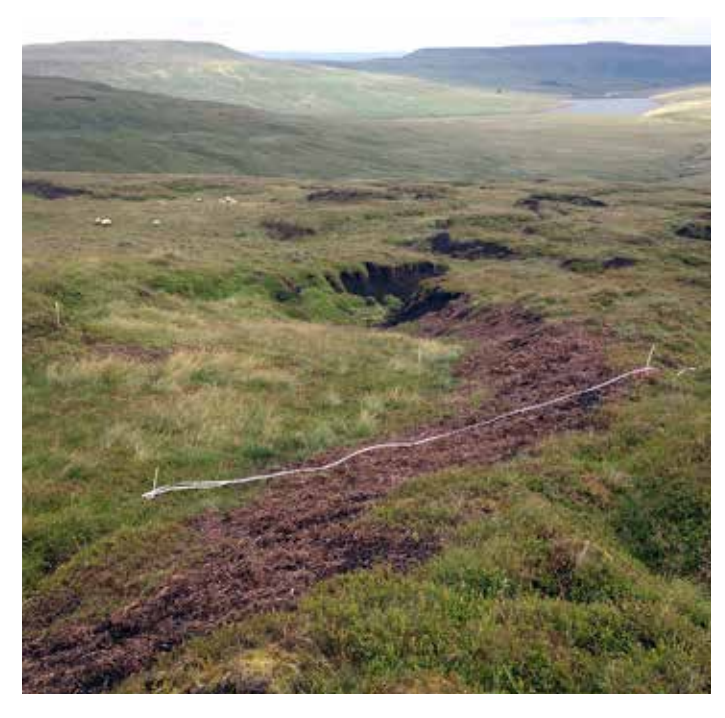
Looking across SE0173 towards Angram Resrvoir, Upper Nidderdale. The plot in the foreground comprises montane heath and a 'peat hag' caused by late snow lie

One of my NPMS squares was in a very remote part of Upper Nidderdale near to the top of Great Whernside (704 m). Access was not an issue because the moorland is open access but getting to it was another matter. I didn't fancy the most obvious approach (a 4 mile walk up a valley with the last 2 miles through deep heather interspersed with bogs!) so I rang a fellow recorder who suggested a much easier alternative. This required a longer drive and very steep climb to the summit but a recce in June confirmed this as the best option and also that I'd need about 5 layers, even at the height of summer, and a 5 hour window to do the work.