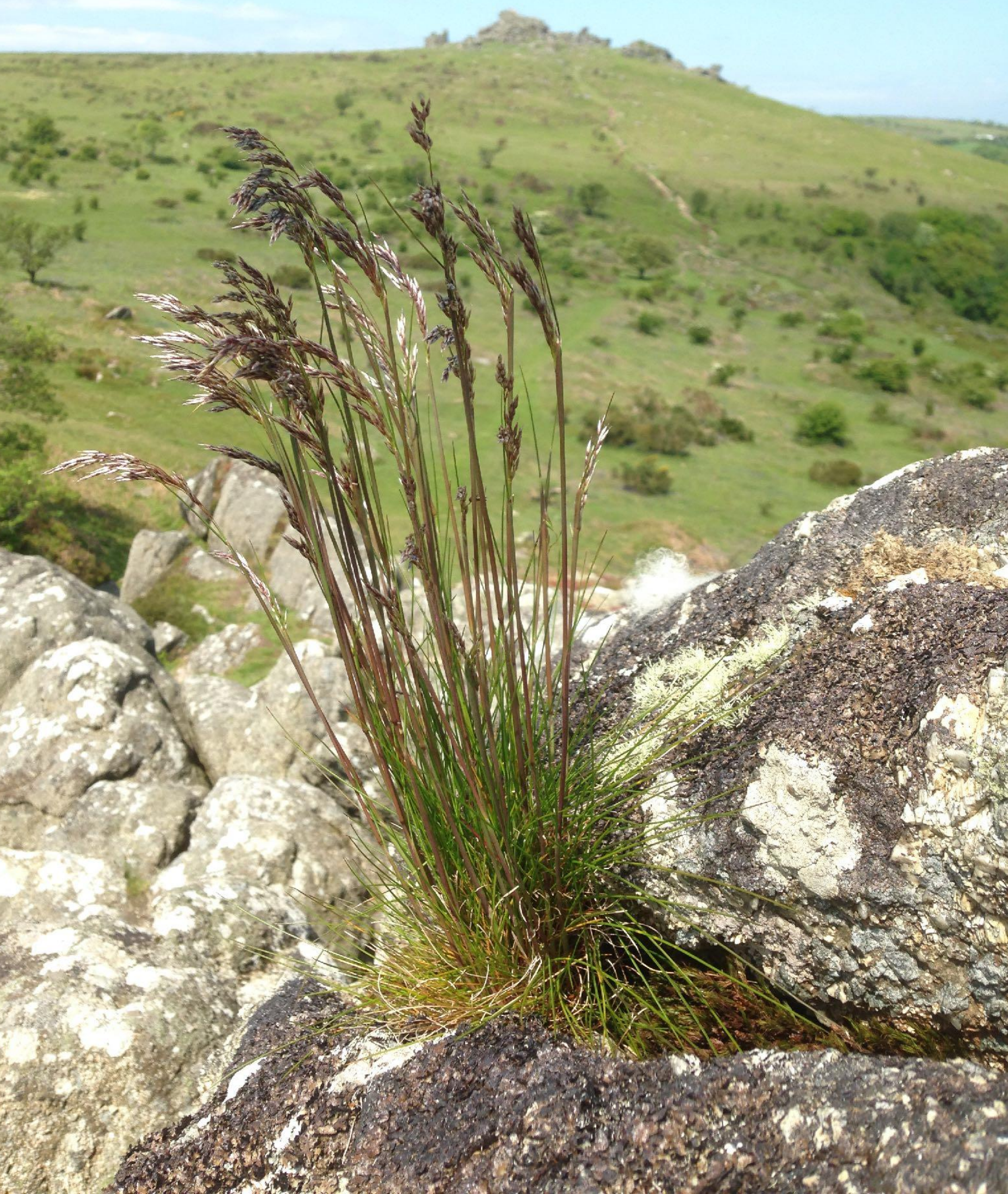
Deschampsia flexuosa Wavy Hair-grass