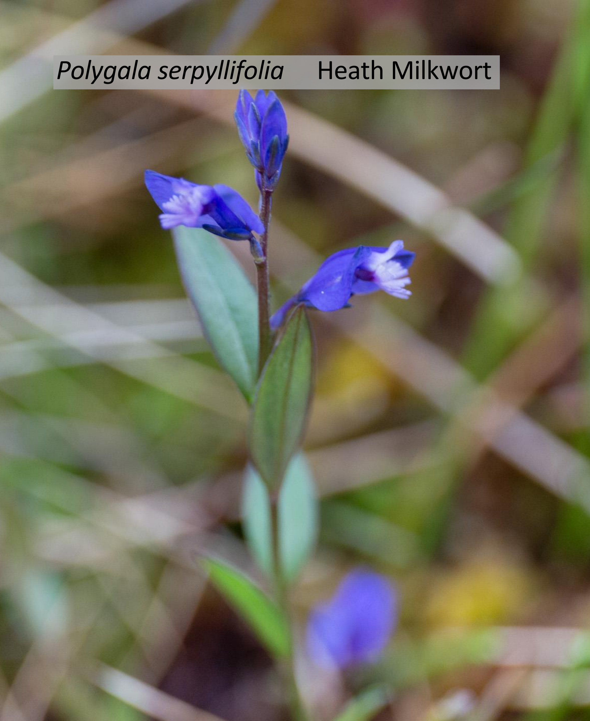
Polygala serpyllifolia Heath Milkwort