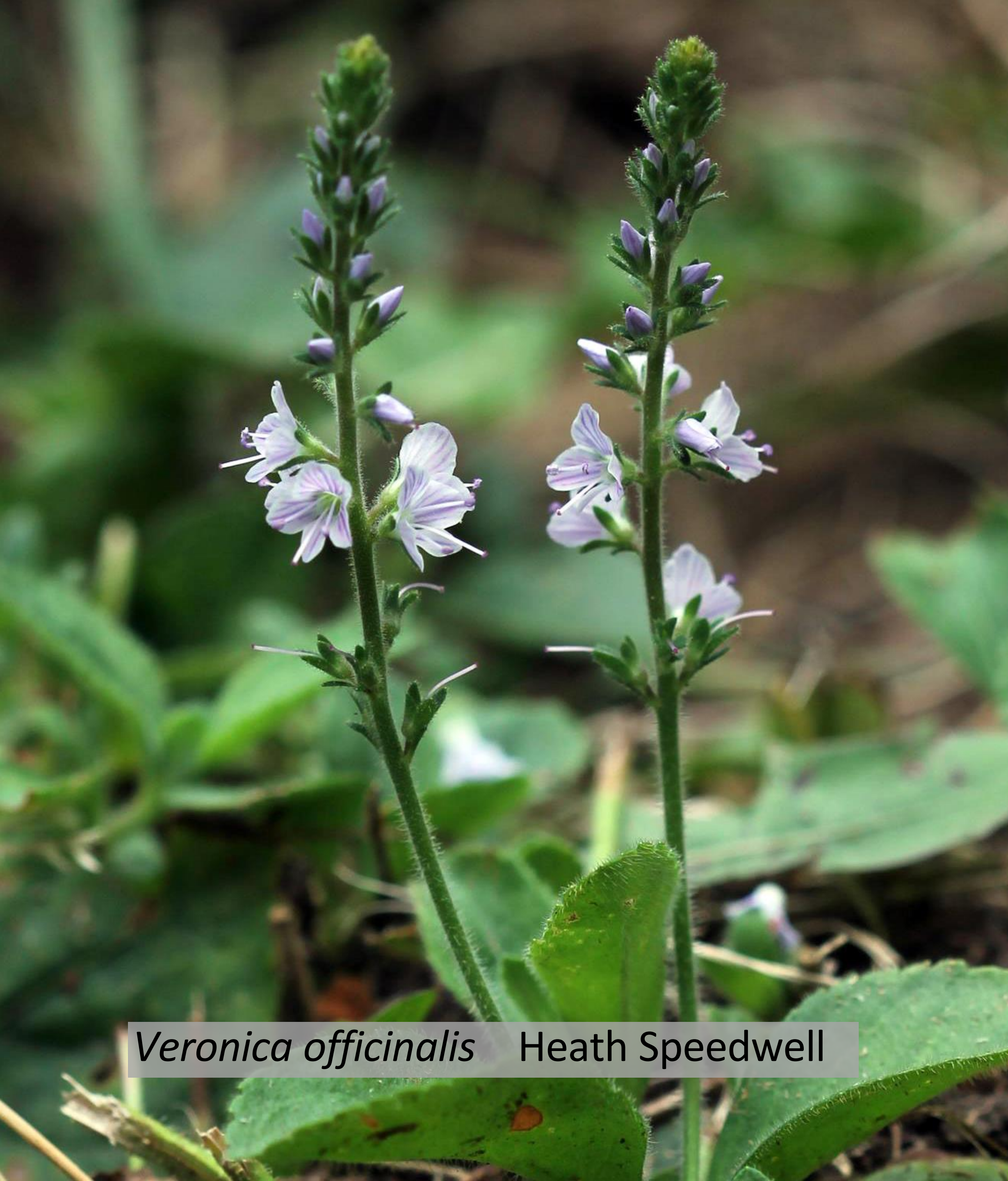
Veronica officinalis Heath Speedwell