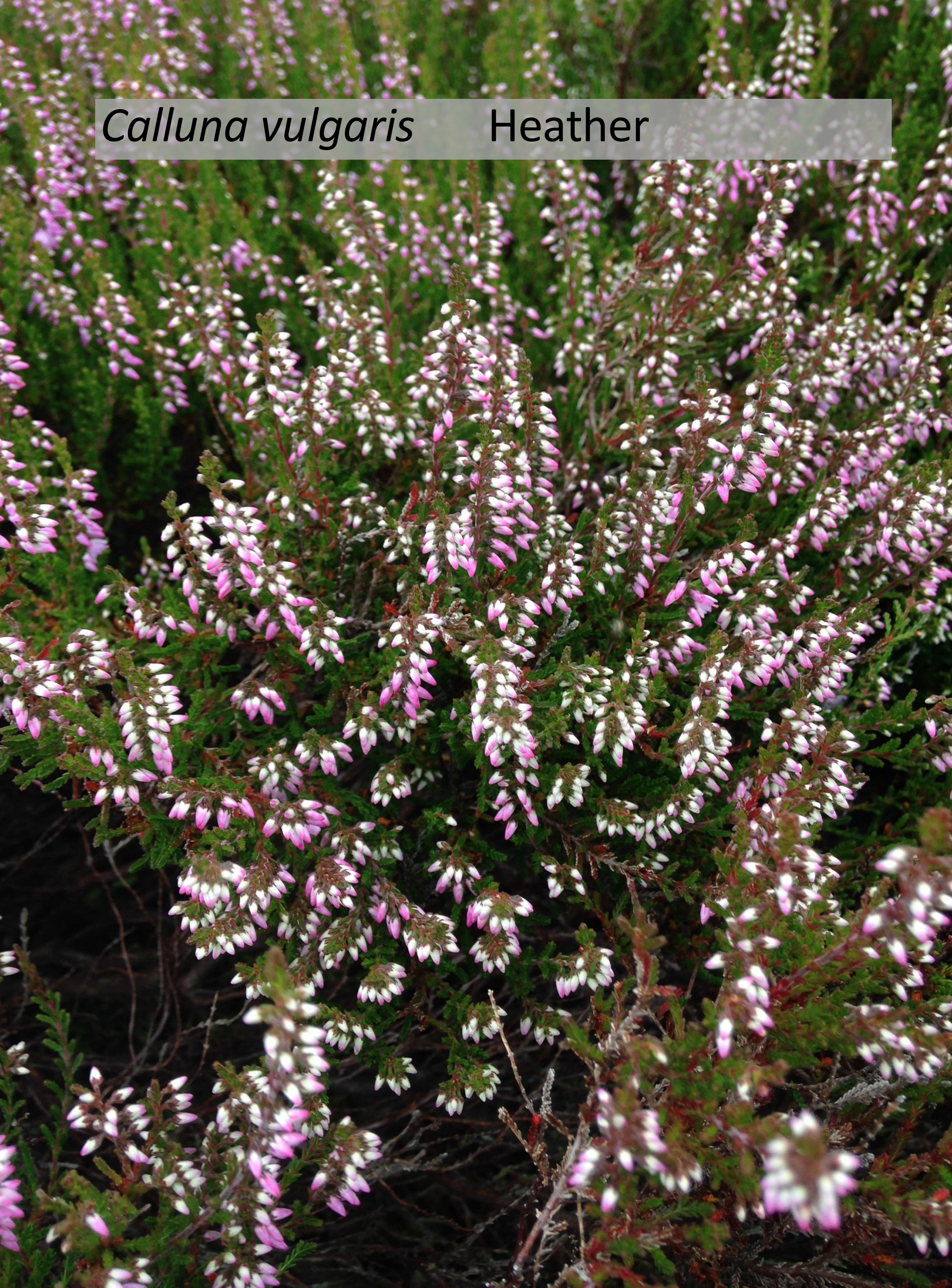
Calluna vulgaris Heather