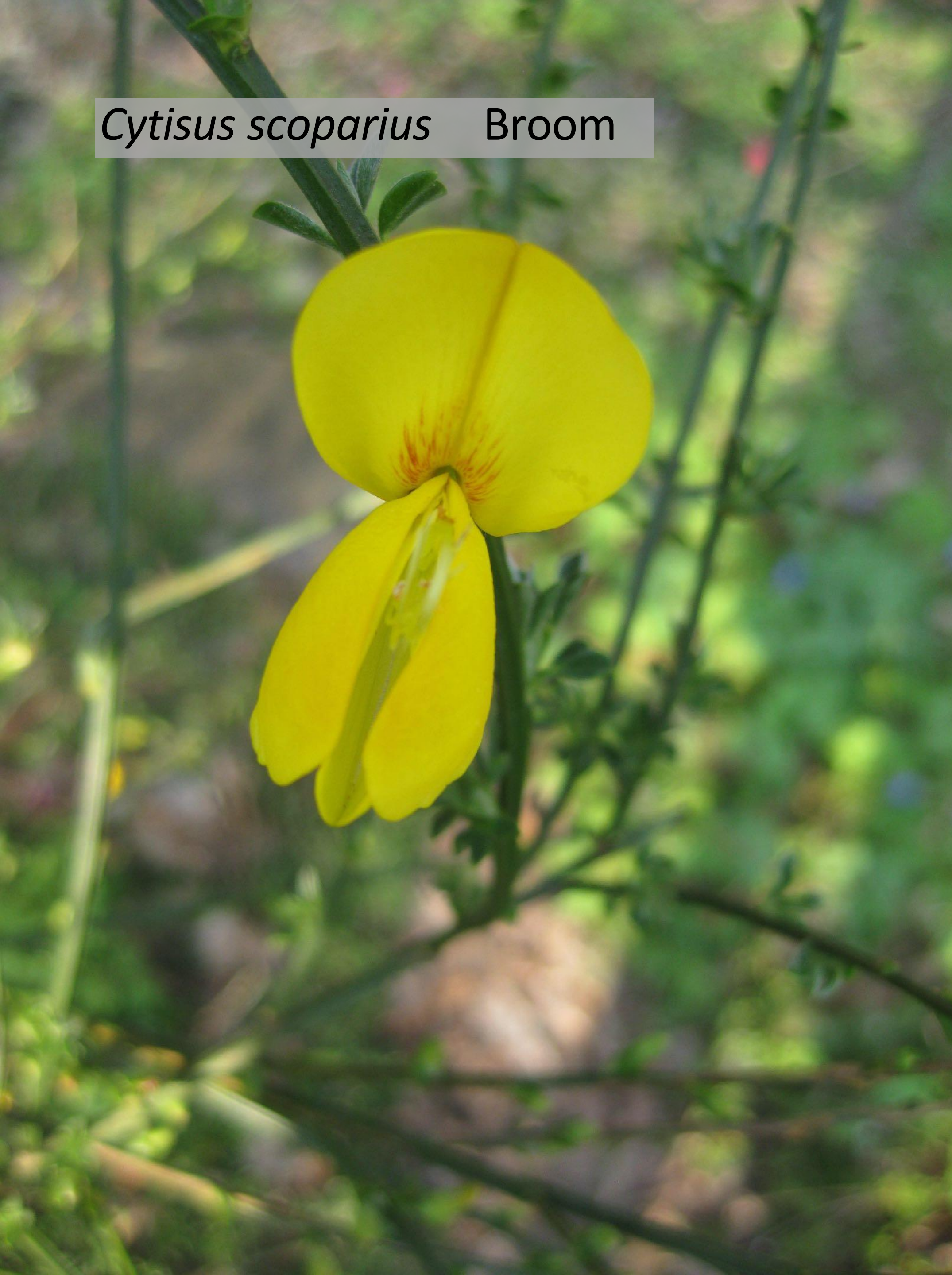
Cytisus scoparius Broom