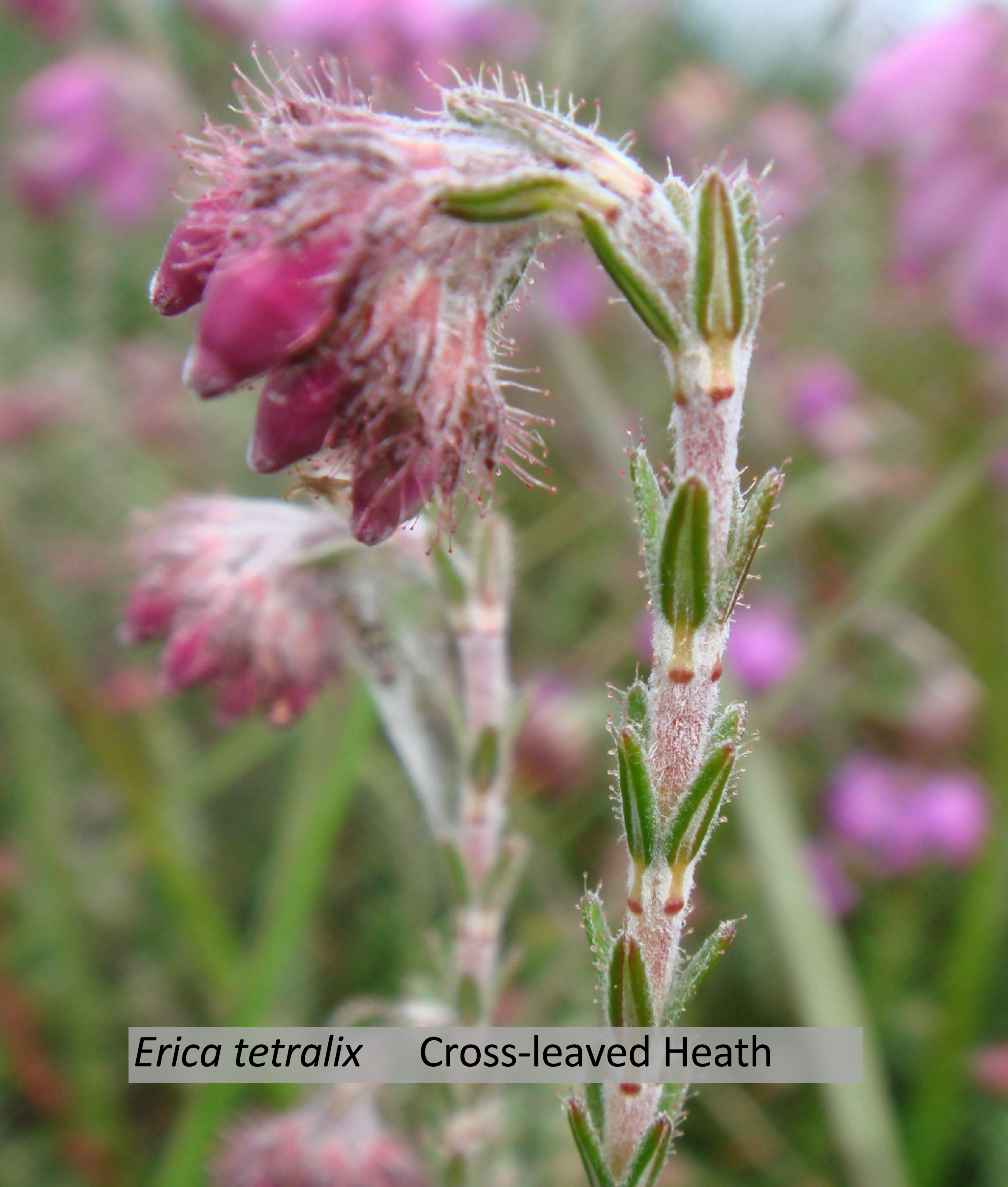
Erica tetralix Cross-leaved Heath