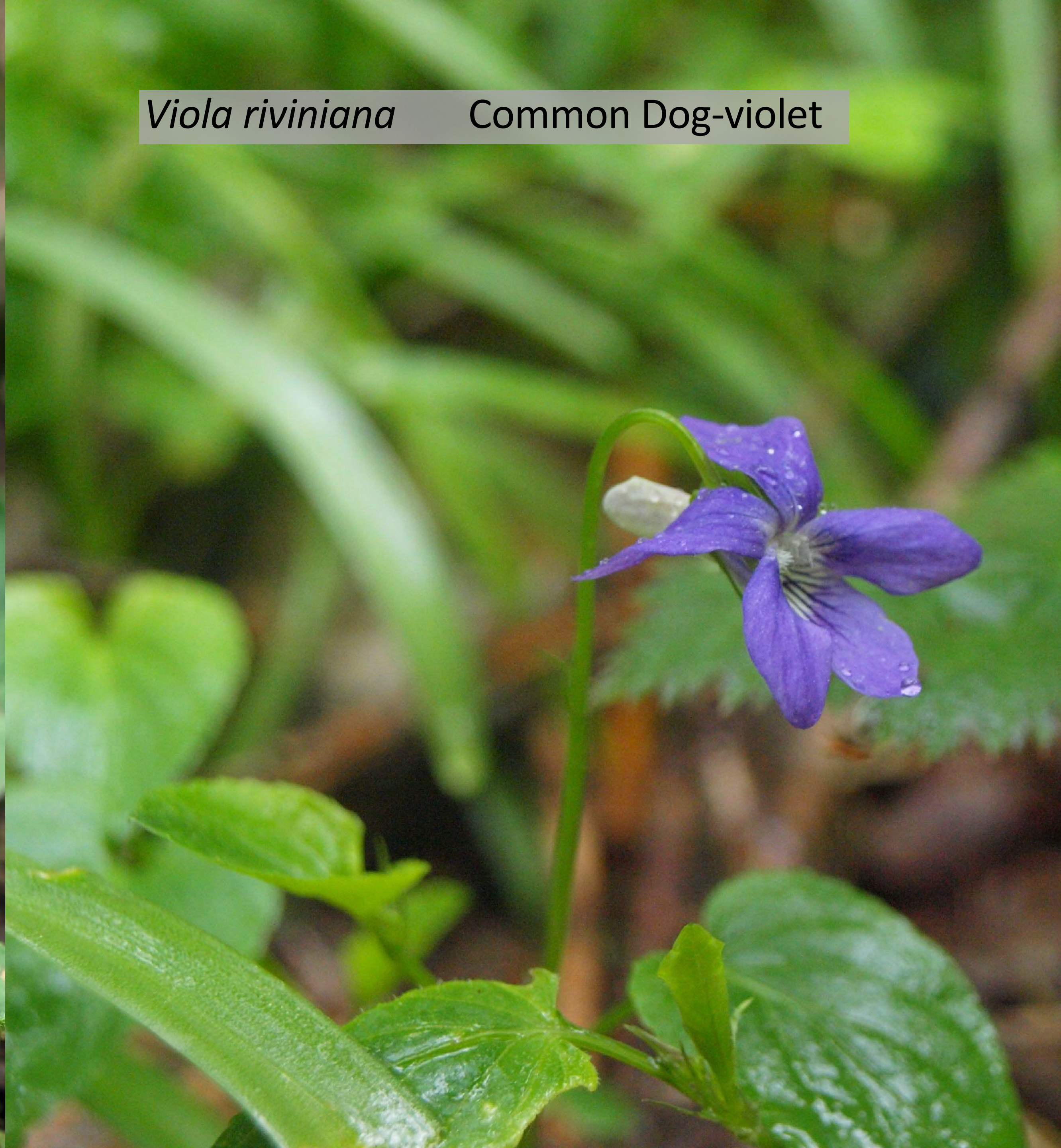
Viola riviniana Common Dog-violet