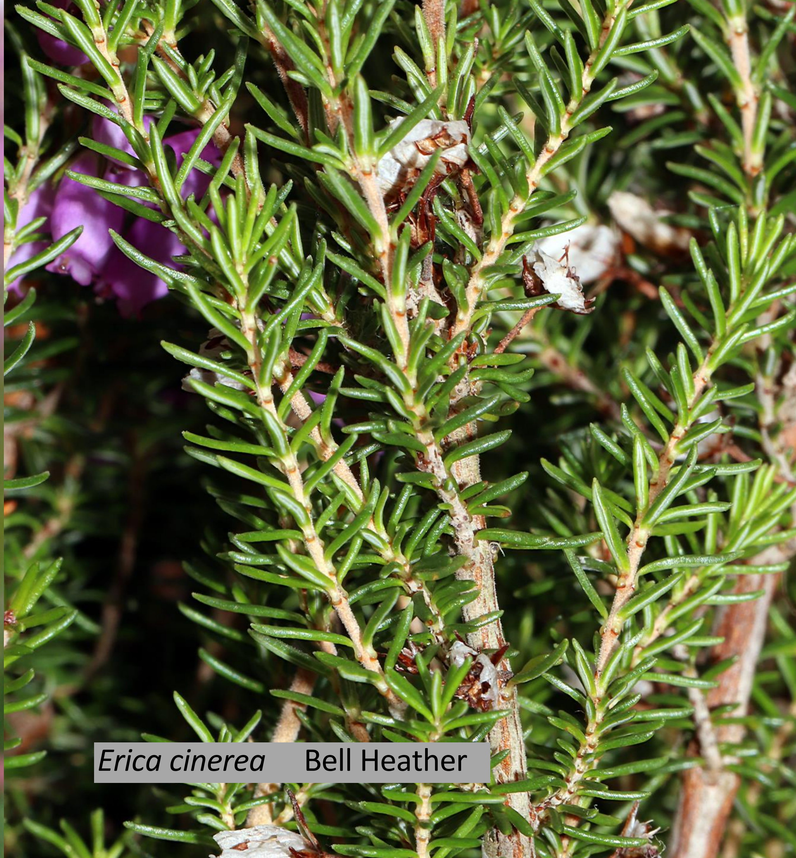
Erica cinerea Bell Heather