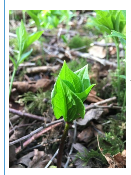
Herb Paris (Paris quadrifolia) emerging in March (left) and in fruit in August (below)