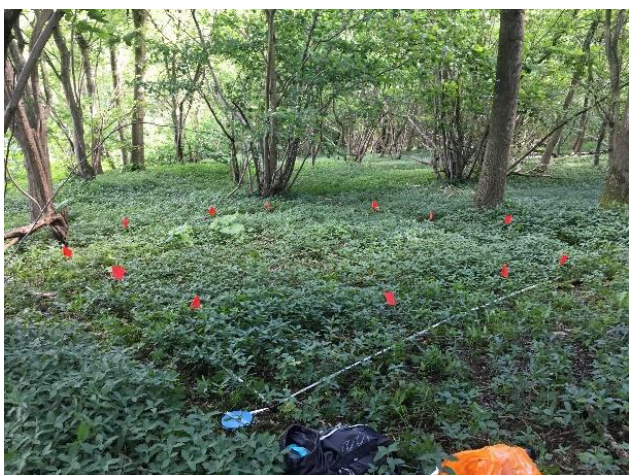
Same view of the plot photographed in December (top) and July (bottom)