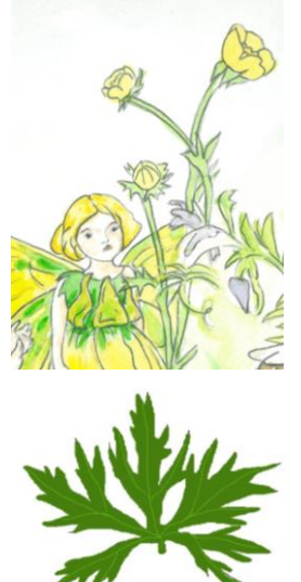
Meadow Buttercup Leaf