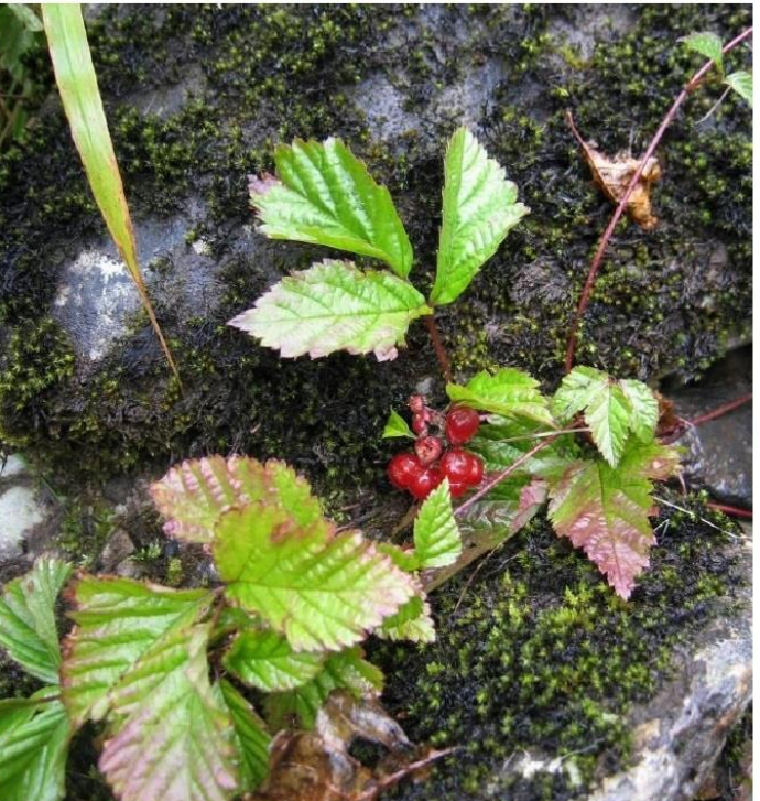
Stone bramble Rubus saxatilis

In the NPMS list this is written as common dog-violet / early dog-violet V. riviniana / reichenbachiana, but V. reichenbachiana (which looks like V. riviniana but has a dark 'spur' sticking up from the back of the flower) is a species of more or less calcareous soils in the lowland of the southern half of Britain, so it is not to be expected in this pine/juniper NPMS habitat.