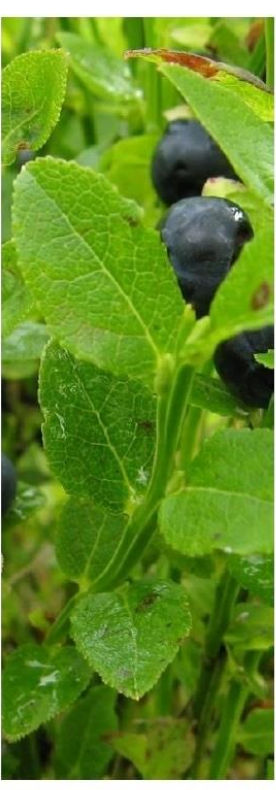
Bilberry/blaeberry Vaccinium myrtillus NPMS pos. indicator. Stems green and ridged. Leaves oval and pointed, with toothed edges.