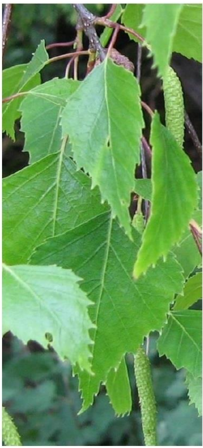
Silver birch Betula pendula

Oval to diamond-shaped leaves with singly-toothed edges.