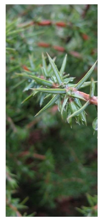
Juniper Juniperus communis

Tree and shrub species listed as NPMS positive indicators in pine woodland and juniper scrub: