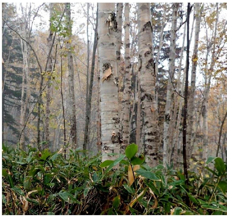
Actually I just put this in for interest. Betula ermanii in Japan!

And the answer to the question on the previous page: