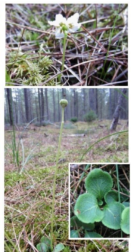
One-flowered wintergreen Moneses uniflora. Solitary flower. Roundish leaf + short stalk + many small, pointed teeth. Very rare.