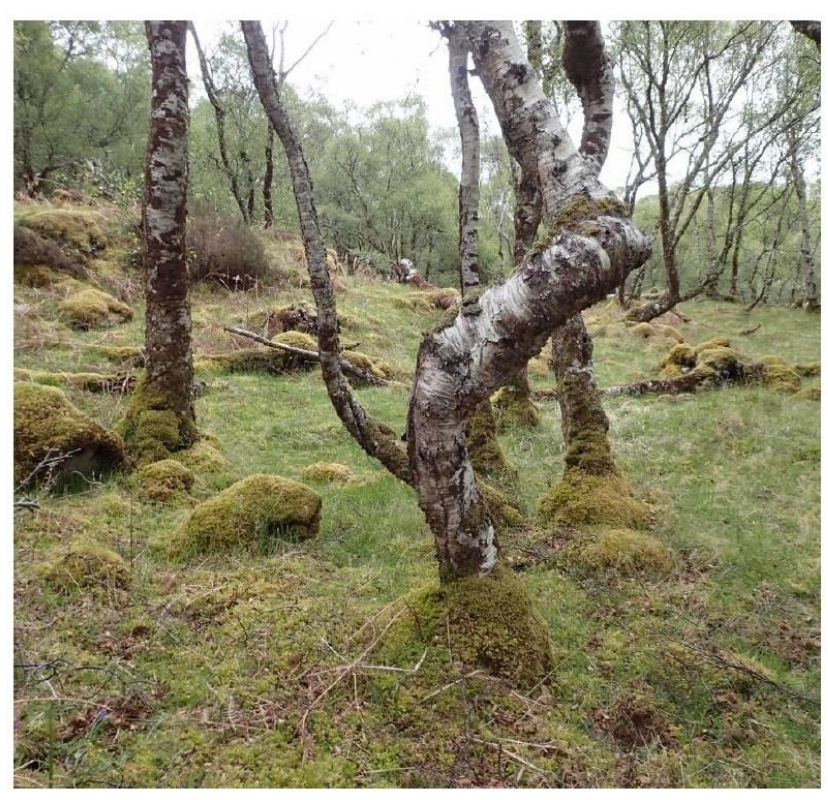
These differences can be useful, along with the leaf shape – what was it now, something about teeth and tips? More about birches on the next page...