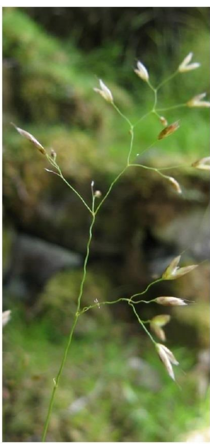
Wavy hair-grass Deschampsia flexuosa Branched head (branches thin and wavy). Leaves very thin and wiry. Grows on acid soils.

Distinctive flower head with narrow spikelets.