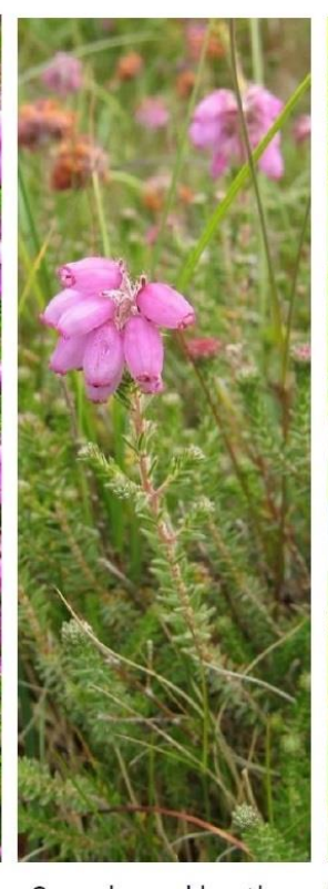
Cross-leaved heath Erica tetralix Not on the positive indicator list. Leaves hairy, in whorls of 4. Round clusters of pale pink flowers.