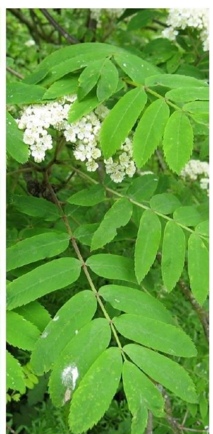
Rowan Sorbus aucuparia

Leaves more diamond-shaped with double teeth and more drawn-out pointed tips.