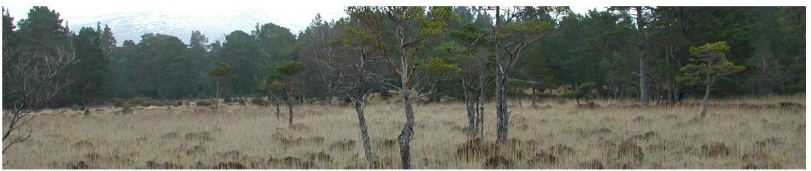
Pinewood and bog in Speyside

• Bog and wet heath: Bog and wet heath can show blurred boundaries with pine woodland and juniper scrub.