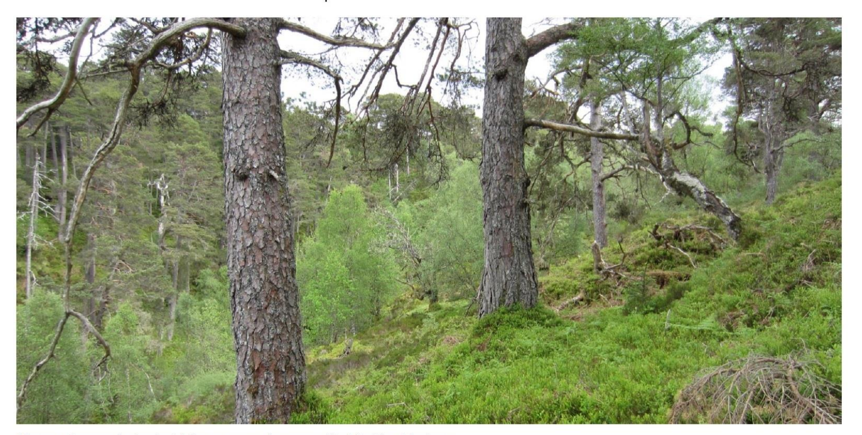
Mature pinewood mixed with large areas of younger birch in Glen Moriston

• Broadleaved woodland: pine and juniper can occur in broadleaved woodland, especially birch woodland on acid soils in upland areas, but in such places broadleaves are dominant and pine and juniper no more than minor components of the canopy. It is natural for some woodland to be intermediate between pinewood and broadleaved woodland or to be a small-scale mosaic of pinewood and broadleaved woodland.