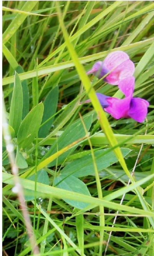
Bitter vetch Lathyrus linifolius

Pale blue flowers on delicate stalks. Leaves small and heart-shaped at plant base but long and very narrow (more linear) up the stem.