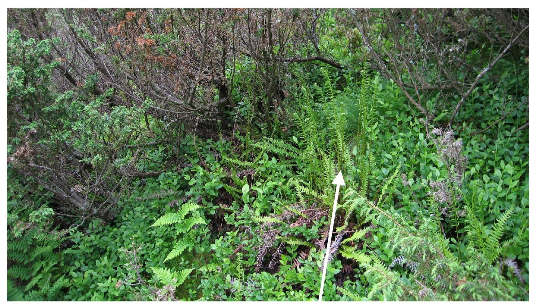
Q7: Which species of fern is this?

... to more heathy, as here in the Lammermuir Hills.