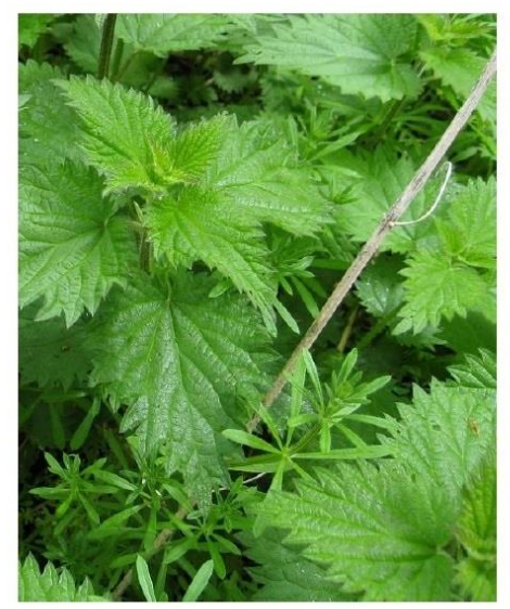
Stinging nettle Urtica dioica

Now is the time to turn our attention to the species with the dubious honour of having made it to the list of NPMS negative indicators in this pine woodland and juniper scrub habitat: