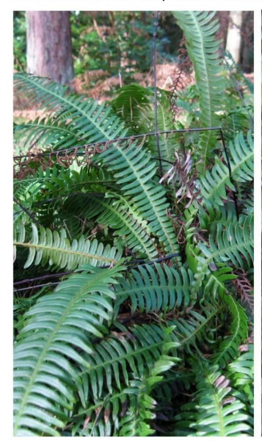
Hard fern Blechnum spicant

Ferns that are NPMS positive indicator species in pine woodland and juniper scrub: