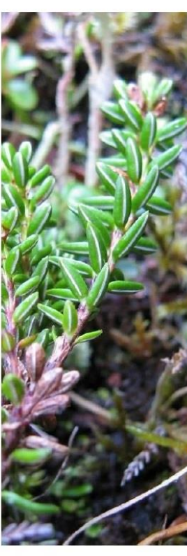
Crowberry Empetrum nigrum NPMS pos. indicator. Leaves in whorls or not, and quite thick, with white stripe running up underside.