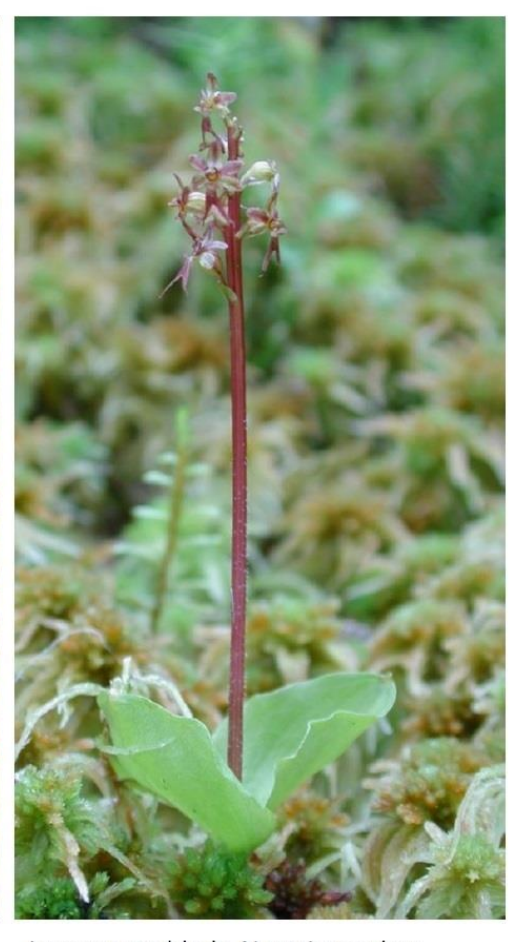
Lesser twayblade Neottia cordata A small orchid with just one pair of leaves a short distance up from the base of the stem, and a spike of small brownish flowers.