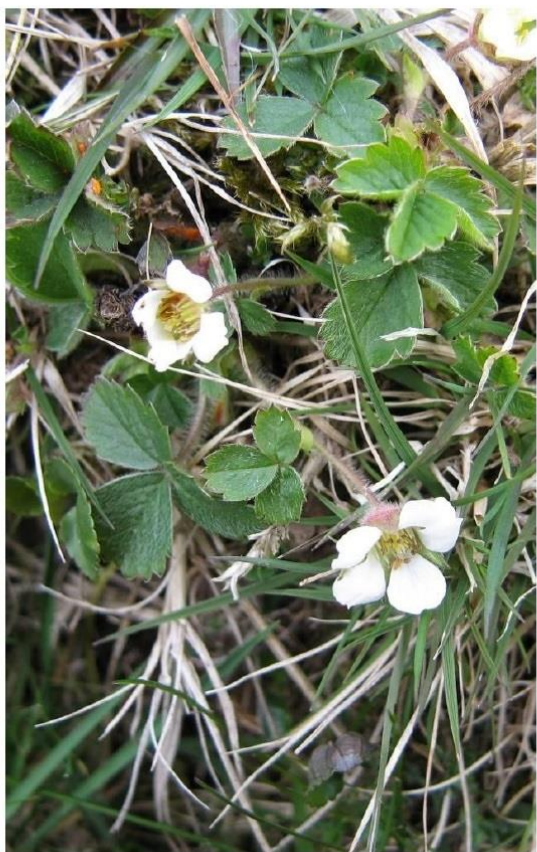
Barren strawberry Potentilla sterilis

Hairs on underside of leaflets are closely appressed (hard to see; underside can look quite smooth). Plant can have edible fruits.