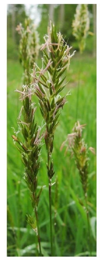
Sweet vernal-grass Anthoxanthum odoratum

Some more NPMS positive indicator species in pine woodland and juniper scrub: