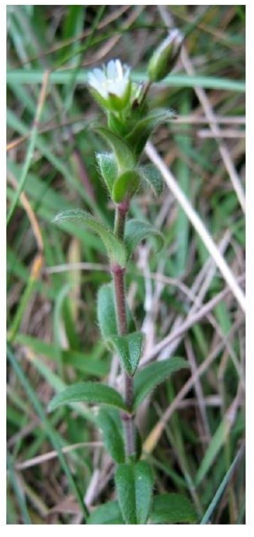
Common mouse-ear Cerastium fontanum

Stems creep over ground and steep rocky banks. Has some similarities to bramble (to which it is related) but is not prickly, has much thinner stems and is very low-grown. Leaves have three leaflets and can also look like those of wild strawberry but with terminal leaflet on its own short length of stalk. Found mainly on neutral to basic soils in northern upland areas.