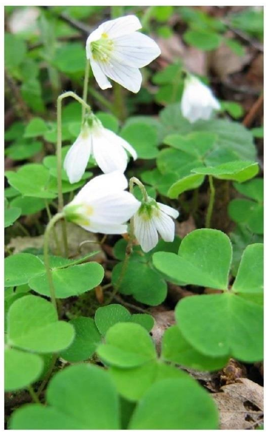
Wood sorrel Oxalis acetosella

Leaves deeply divided in star-like pattern. Rather large white 6-petalled flowers.