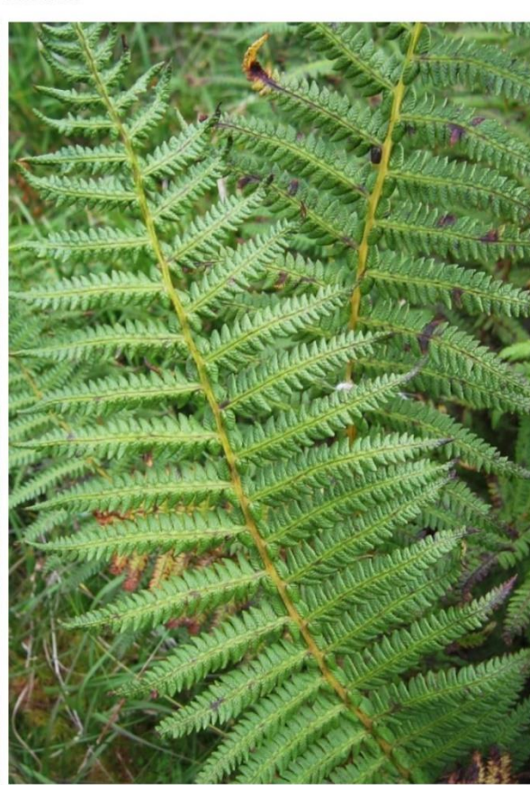
Lemon-scented fern Oreopteris limbosperma

Triangular fronds not in tufts. Fronds are very subdivided with end divisions rather blunt-tipped. Stem and branches thin, so plant looks delicate.