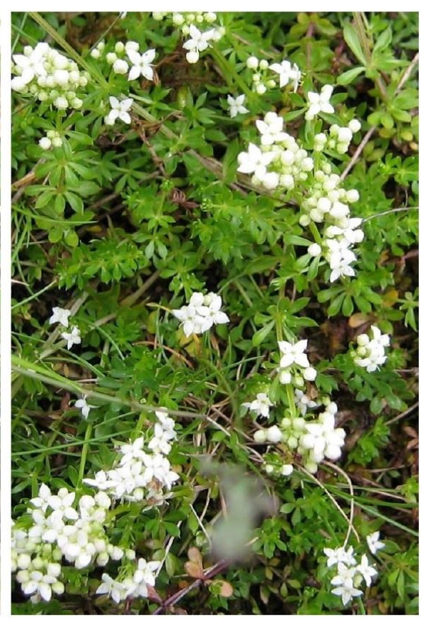
Heath bedstraw Galium saxatile

Hairs on leaflet underside stick out, looking more hairy than in Fragaria . Also, leaf is duller green and terminal tooth very small. No fruits.