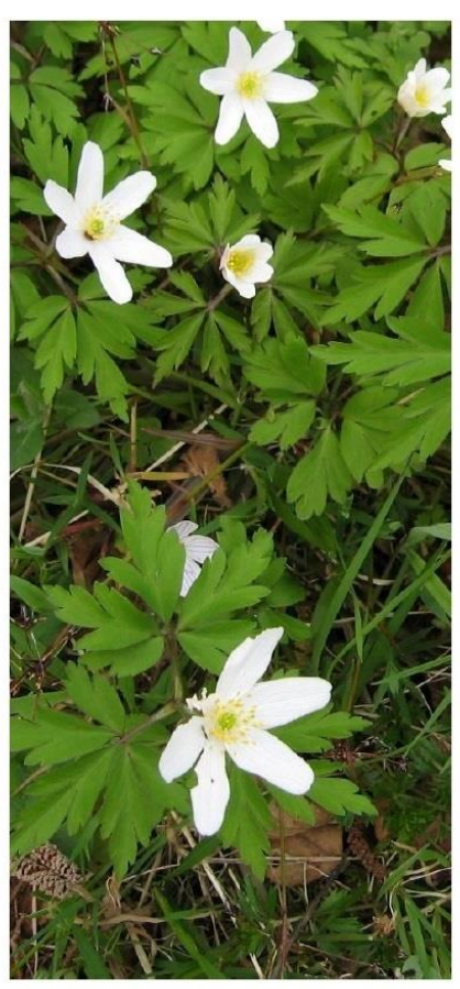
Wood anemone Anemone nemorosa

Leaves deeply divided in star-like pattern. Rather large white 6-petalled flowers.