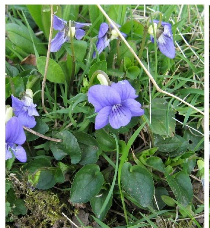
Common dog-violet Viola riviniana

Last page of NPMS positive indicator species in pine woodland and juniper scrub: