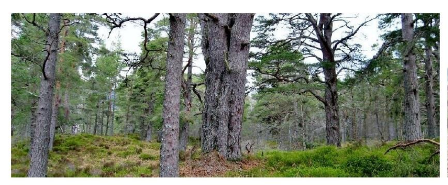
Native pine woodland in the Black Wood of Rannoch, Perthshire

JUNIPER SCRUB: Juniper scrub in upland areas of Scotland, northern England, Wales and the Mourne Mountains (N Ireland). This is generally on acidic soils. Lowland juniper scrub on calcareous soils, on sandy soils (including dunes) or on shingle is not included here.