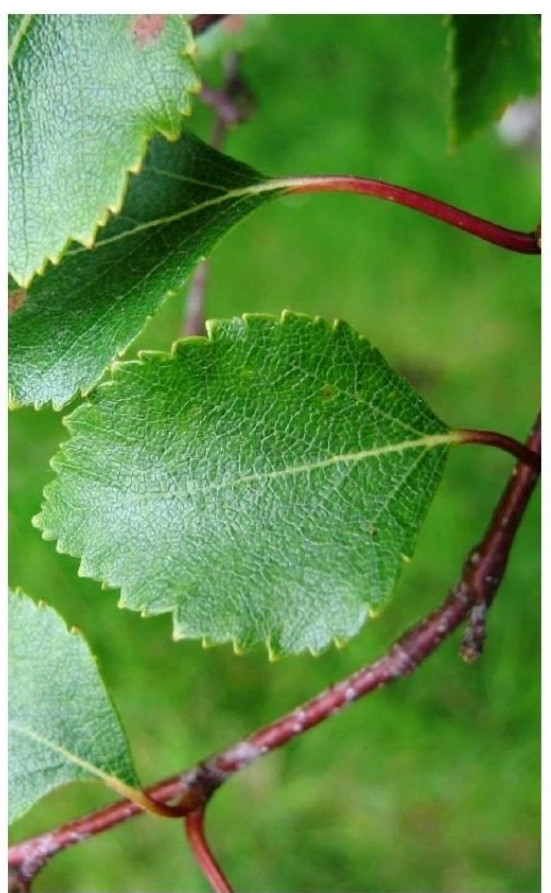
Downy birch Betula pubescens

Conifer shrub of varied shape and size. Sharply pointed leaves in whorls of three.