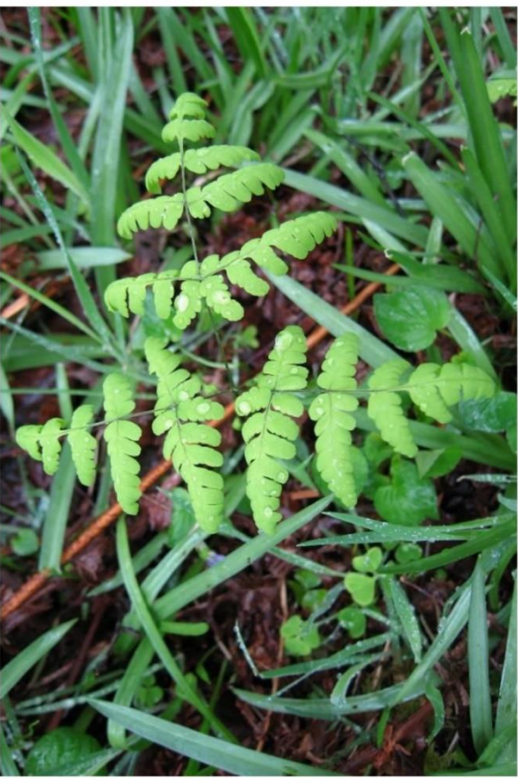
Oak fern Gymnocarpium dryopteris

Forms tufts or low tussocks on acid soil. Fronds are leathery and single-pinnate (side divisions not divided further).