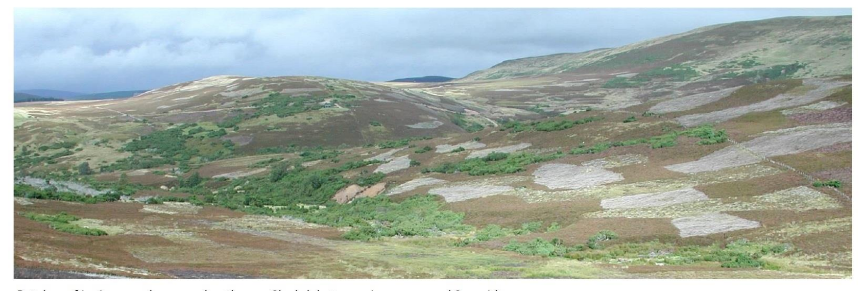
Patches of juniper scrub among heath near Slochd, between Inverness and Speyside

However, many patches of juniper scrub scattered among heaths are dense, with quite sharp boundaries