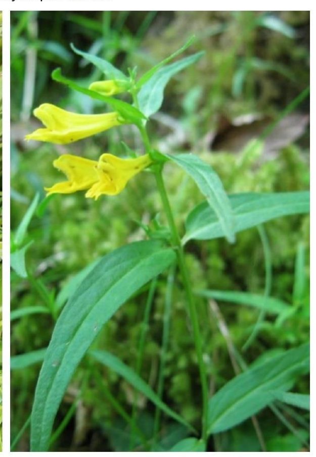
Common cow-wheat Melampyrum pratense

2-4 pairs of leaflets, so leaflets are fewer and larger than in most vetches. Flowers pink-purple, in groups of 2 to 6.