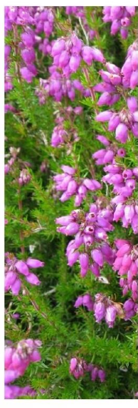
Bell heather Erica cinerea NPMS pos. indicator. Leaves in whorls of 3. Bright mid pinkpurple flowers in short to long spikes.