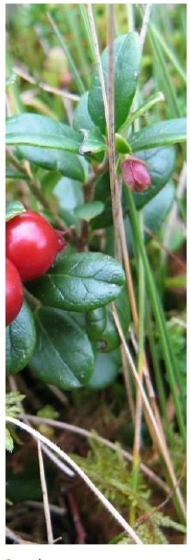
Cowberry Vaccinium vitis-idaea NPMS pos. indicator. Stems browner than in bilberry. Leaves dark, evergreen, blunt and untoothed.