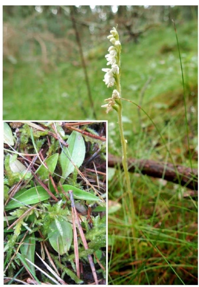
Creeping ladies-tresses Goodyera repens Oval, blunt, untoothed dull green leaves in low rosettes (see inset photo). Spike of white flowers; the spike can show some degree of spiral twist.