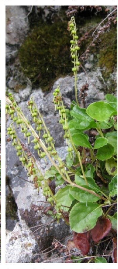
Serrated wintergreen Orthilia secunda. Leaf oval and pointed, with obvious teeth (11-15 per side).