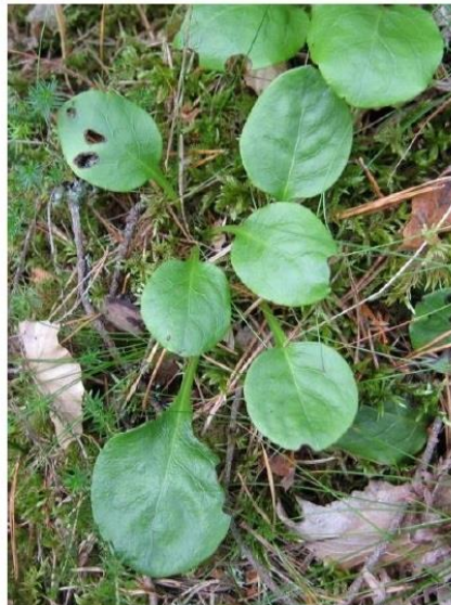
Intermediate wintergreen P. media . Leaf broad oval to rounded, with <16 shallow teeth per side; leaf stalk at least as long as leaf.