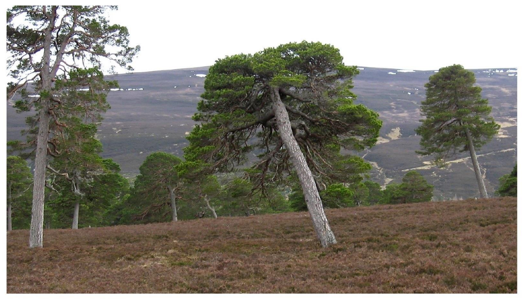
Heath and native pines in Deeside

Heathland: Open heath with scattered pine and/or juniper can grade into thicker stands of pine or juniper woodland/scrub. It can be hard to define the exact position of the heath-woodland boundary, as it is normal and natural for many vegetation boundaries to be gradual and indistinct.