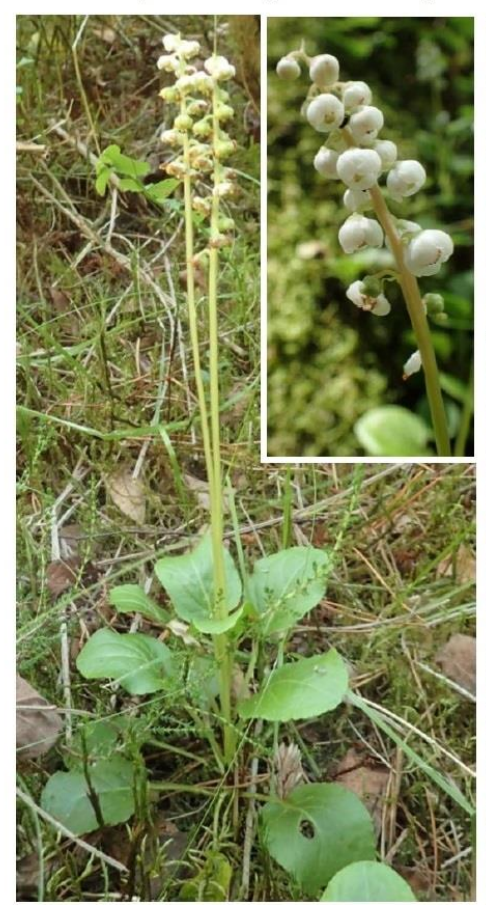
Common wintergreen Pyrola minor . Leaf broad oval and blunt, with 16+ shallow teeth per side; leaf stalk typically a bit shorter than leaf.

Two pages of uncommon wildflower specialities of pine woodland. More details about these are in the Plantlife booklet 'Managing Scotland's pinewoods for their wild flowers' at https://www.plantlife.org.uk/application/files/7314/8233/9572/25747_PinewoodFlowersLRes.pdf