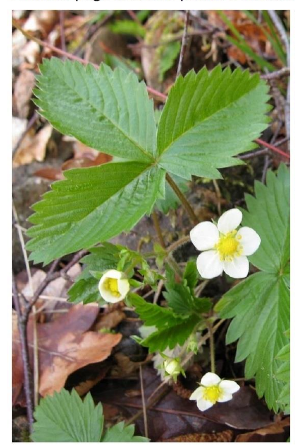
Wild strawberry Fragaria vesca

Another page of NPMS positive indicator species in pine woodland and juniper scrub: