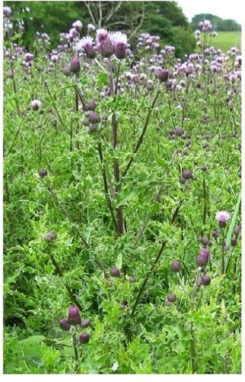
Creeping thistle Cirsium arvense

Native, but classed negatively because it is an indicator of eutrophication: it can increase in response to artificial nutrient enrichment (e.g. runoff from fields treated with agricultural fertilisers, or dung and urine from livestock) and can then outcompete other plants.