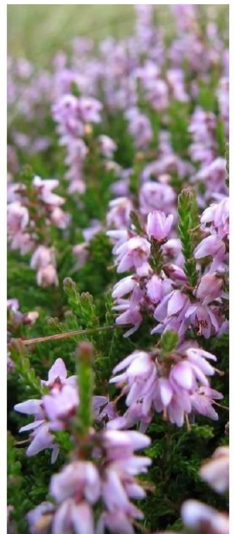
Heather Calluna vulgaris NPMS positive indicator. Leaves tiny and not in whorls. Very small pale pink flowers (paler than in Erica species).

Dwarf shrubs of pine woodland and juniper scrub (all but one = listed as NPMS positive indicators in this habitat):