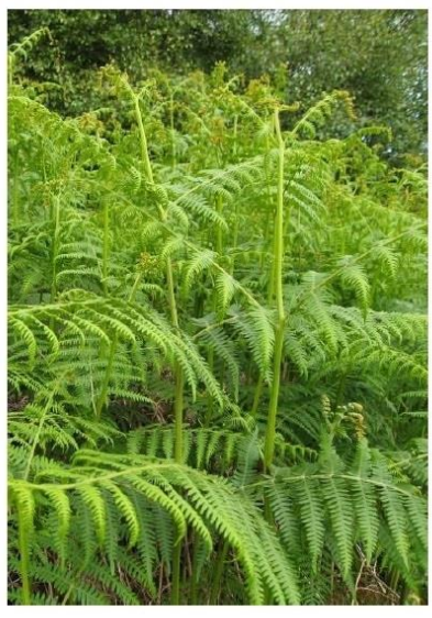
Bracken Pteridium aquilinum

Distinguished from other thistles by its leaves being prickly but its stems actually lacking prickles. Native and very common, especially where there has been some ground disturbance such as trampling, or where such disturbance is combined with nutrient enrichment.