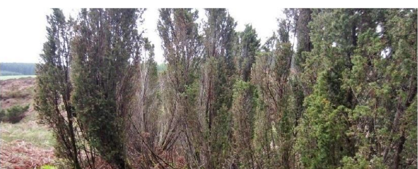
Juniper scrub in the Southern Uplands