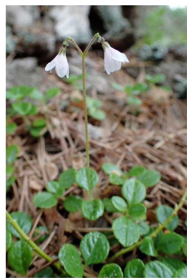
Twinflower Linnaea borealis Low trailing stems with small roundish leaves in opposite pairs. Flowers in pairs on upright, branched stalk. Can form extensive patches carpeting the ground.

Second page of uncommon wildflower specialities of pine woodland: