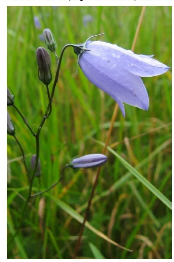
Harebell Campanula rotundifolia

Just two more pages of NPMS positive indicator species in pine woodland and juniper scrub: